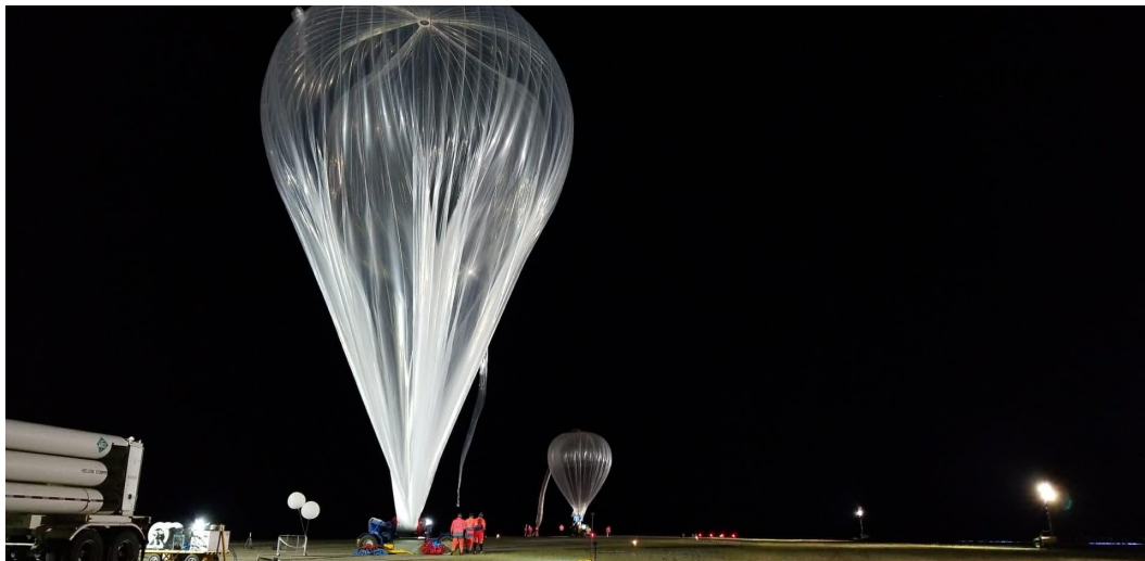
Figure 2.1: Stratospheric Balloon Launched by the CSA in Timmins

The CSA operates a stratospheric balloon program called STRATOS which provides Canadian academia and industry with an opportunity to test and validate new technologies and perform scientific experiments in a near-space environment, while inspiring and training the next generation of experts. Launches typically occur at the end of the summer in Timmins, Ontario.